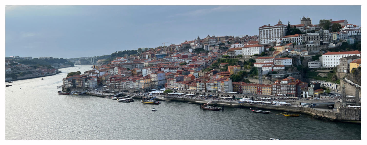
The beautiful river Douro framed by the amazing old town of Porto